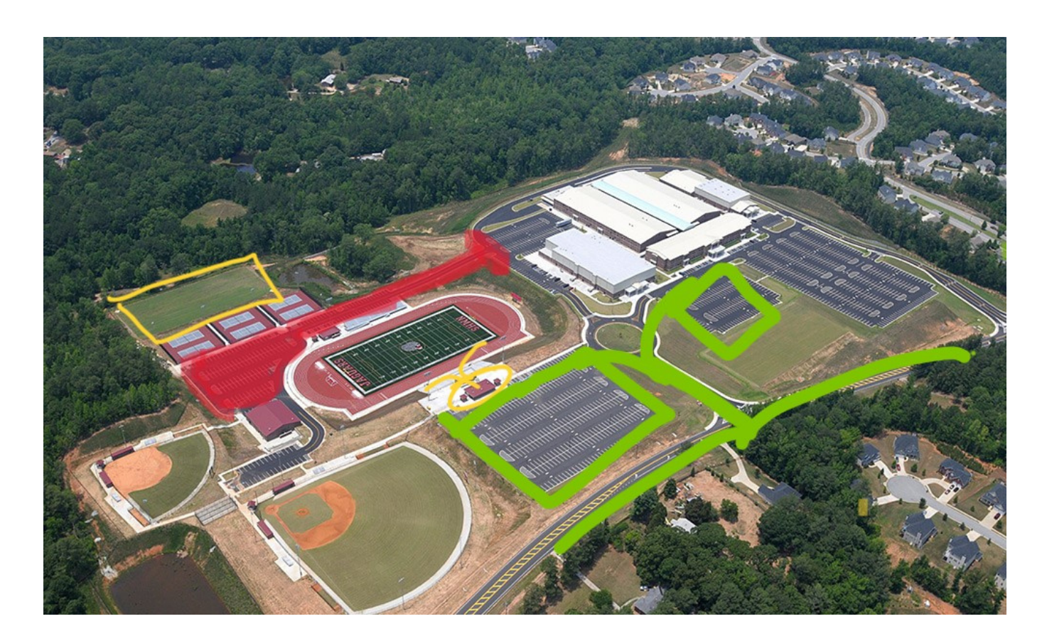
New Manchester HS, 4925 Hwy 92, Douglasville GA 30135